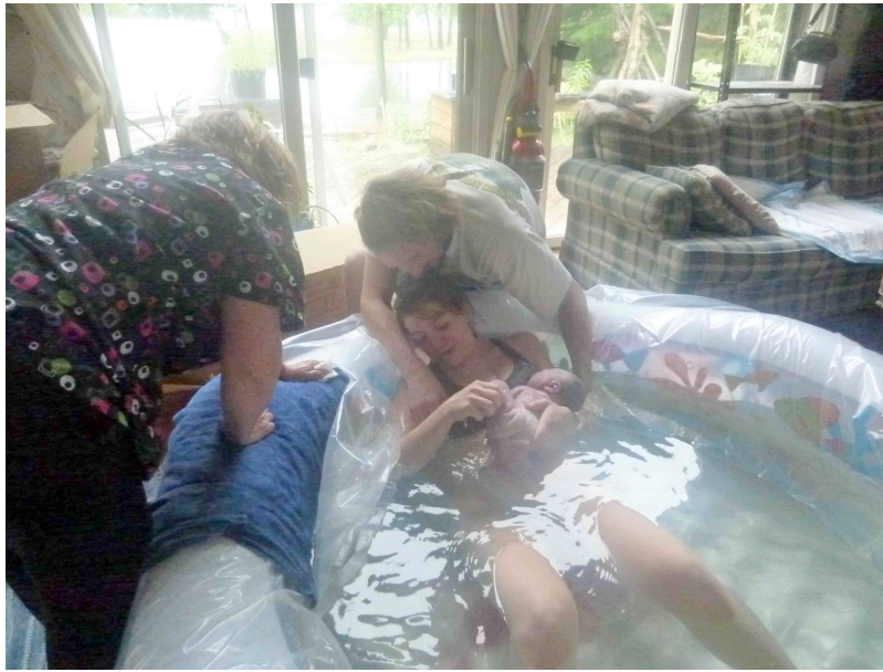
Is it a boy or girl?