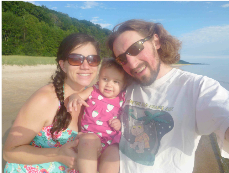
We drove to Lake Michigan after our last prenatal appt. This was also our last picture as a family of 3.