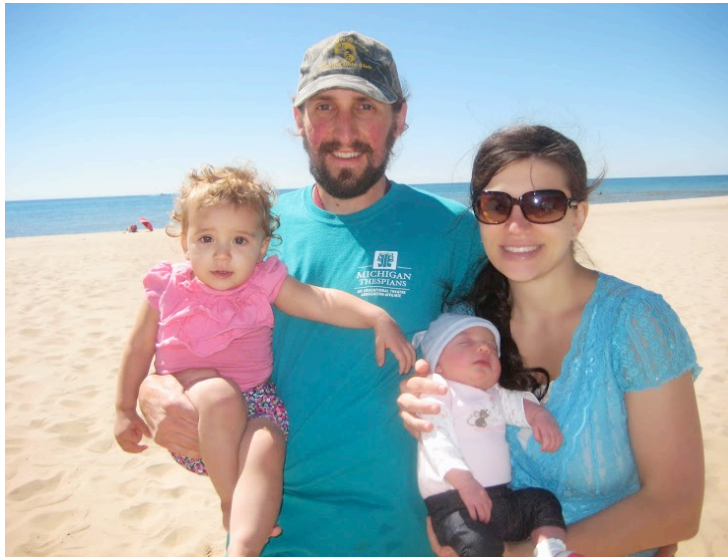
Back at Lake Michigan before our 2 week postnatal. This time we are a family of 4!